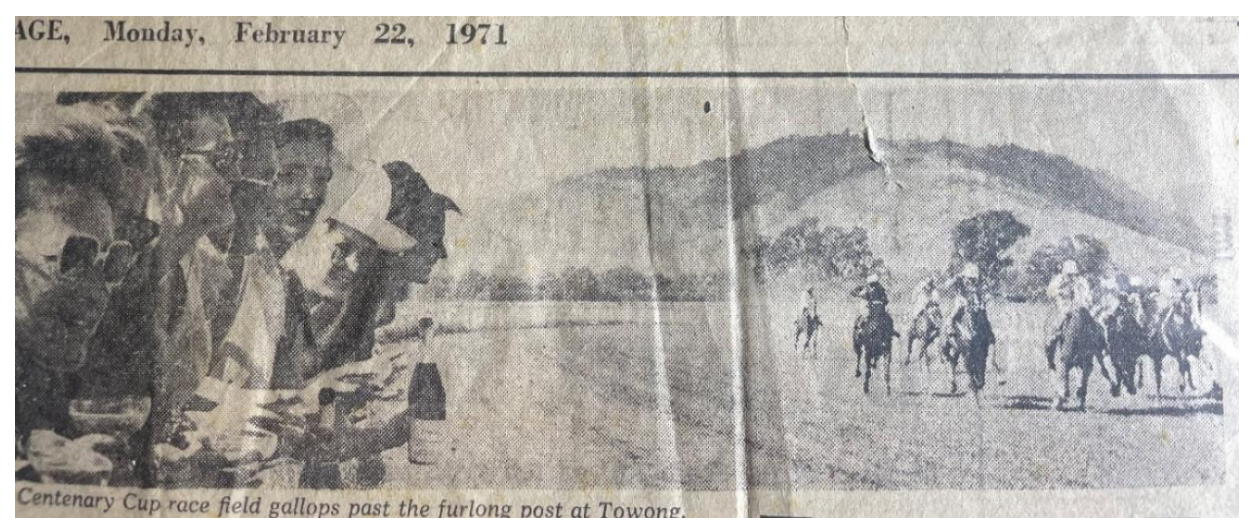
Image 1. Centenary Cup Finish, Towong, 1971, Towong.

Moab, the local "toast of Towong" won the Centenary Gold Cup at Towong in 1971, in front of a jubilant crowd.