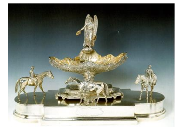
Image 4. Melbourne Cup 1892.

sale. It was advertised for auction by Christies in Melbourne in 2000, and expected to make between $60 000 and $80 000, being described in the Christies catalogue as: "a silver and electroplated trophy surmounted by the figure of Victory holding wreaths, upon a shell shaped cup decorated with rocaille, flowers, scrolls and satyr masks.....having three racehorses with jockeys up flanking and facing the cup.....". The auction was attended by several members of the Sutherland family intending to buy the Cup "at a price", but in fact it was passed in.