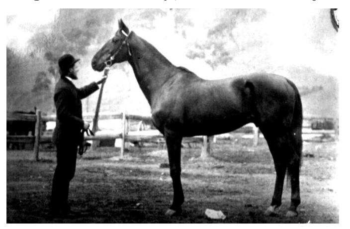
Image 3. Glenmarkie – Sire of Glenloth.

considerable success around the district and further afield, as can be seen in Glenloth's track record below. His wins in 1891 as a three-year-old were impressive, including the Towong Handicap in March and continuing with wins at Corowa, then Narrandera, then Hay, where he won the Handicap over 11 furlongs in May.